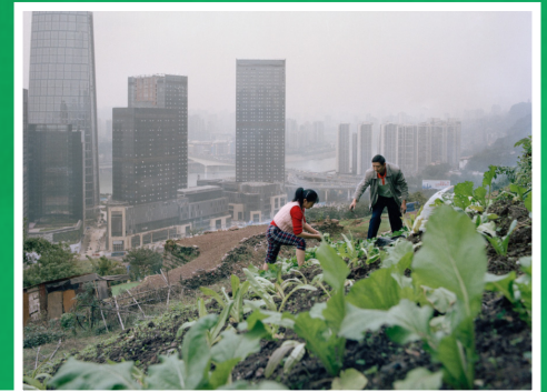
An urban farm in China

Create a community space where people can grow and share fruit and vegetables, nestled in city or town surroundings. Urban farms are massive community assets, and showcase how cohesive citizens are. But there is a downside... It will need to be powered by dedicated volunteers.